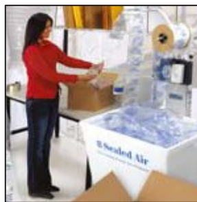
Fill-Air® On-site air cushioning system