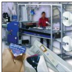
PriorityPak™ Automated Packaging System