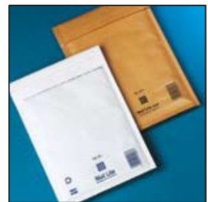
Mail Lite® Protective postal bags