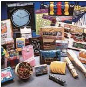
Cryovac® Performance Shrink films