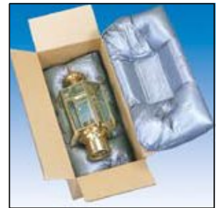
Instapak® Foam-in-place packaging