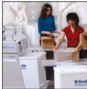
NewAir I.B.™ 200 Packaging System