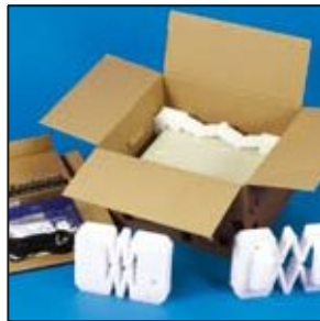
Stratocell® High performance cushioning