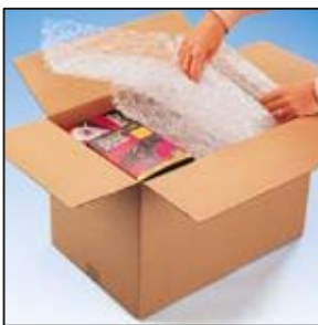
AirCap® Barrier-sealed bubbles

Sealed Air's industry-leading investment in research and development and constant focus on World Class Manufacturing principles allow us to continue to deliver innovative packaging solutions that add measurable value to our customers' business around the world.