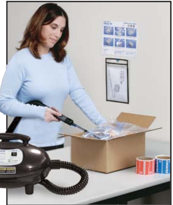
Fill-Air® RF P40 Portable Inflator

The Portable Inflator can be set up anywhere. The Pneumatic Inflator is ideal for both individual and online workstations.