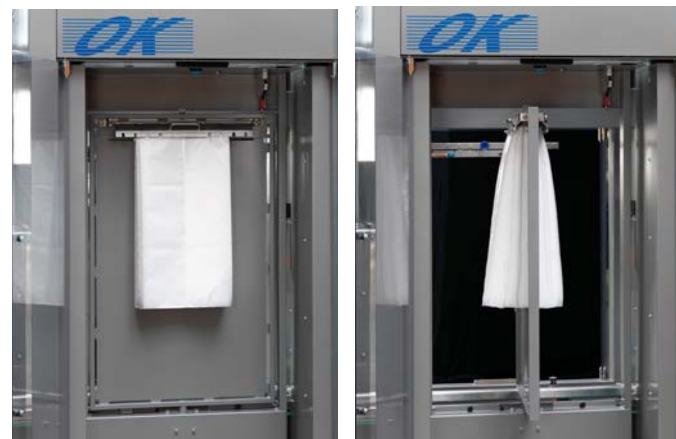
Automatic wicket change - provides continuous production