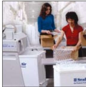
NewAir I.B.™ 200 Packaging System