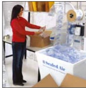
Fill-Air® On-site air cushioning system