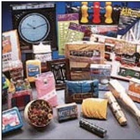
Cryovac® Performance Shrink films