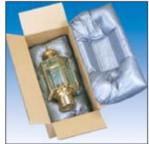
Instapak® Foam-in-place packaging