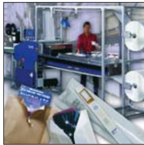
PriorityPak™ Automated Packaging System