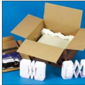
Stratocell® High performance cushioning