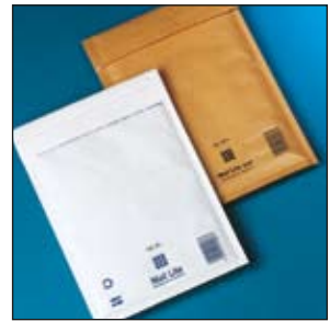
Mail Lite® Protective postal bags