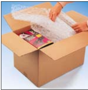
AirCap® Barrier-sealed bubbles

Sealed Air's industry-leading investment in research and development and constant focus on World Class Manufacturing principles allow us to continue to deliver innovative packaging solutions that add measurable value to our customers' business around the world.